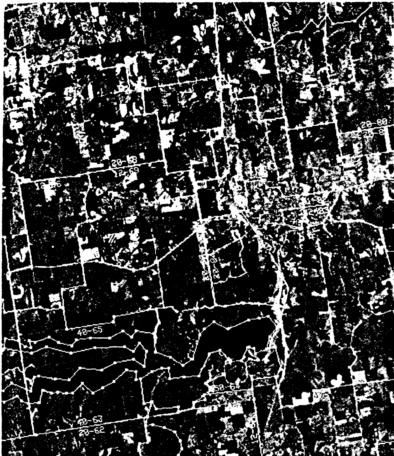
Figure 3.— DLG and PSU boundaries. A 512- by 512-pixel window of TM image of Linn County was displayed using channels 1, 3, and 5 in blue, green, and red, respectively. Therefore, the highly vegetated areas appear to be dark red. Using the two graphic overlay planes, DLG transportation boundaries were overlaid in blue, and the boundaries of the PSUs were overlaid with strata labels in white.